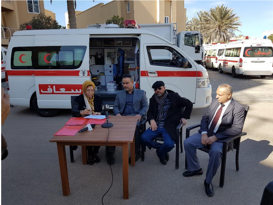
Deliveries of the ambulances to Obari Hospital

The assistance package for Obari amounts to USD 3.9 million. Of the seven civil works, four contracts are already under way. Of the five equipment lots, three have been approved and transferred to government (ambulance, garbage truck and generator). The mobile pesticide sprayer will be delivered within the next two months while medical equipment is pending confirmation of specifications by health authorities.