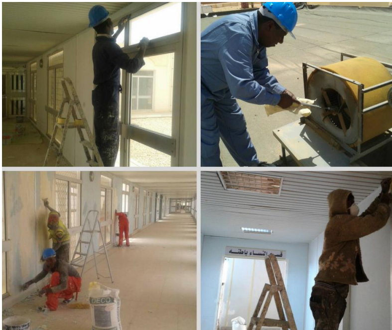
Rehabilitation on general hospital, Obari